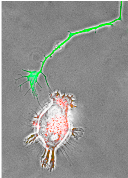
A motor axon growth cone (green) approaching a cell expressing an ephrin (red).

so we started making knockouts of the receptors. Right around this time, the ligands of these Ephs were found. It became clear that one of these ligands, which are now called ephrins, is an axon guidance cue. So then we knew what to look for in the mice, and it only took a few weeks to find that some of the major axon bundles in the brain were misguided in our Eph knockout mice.